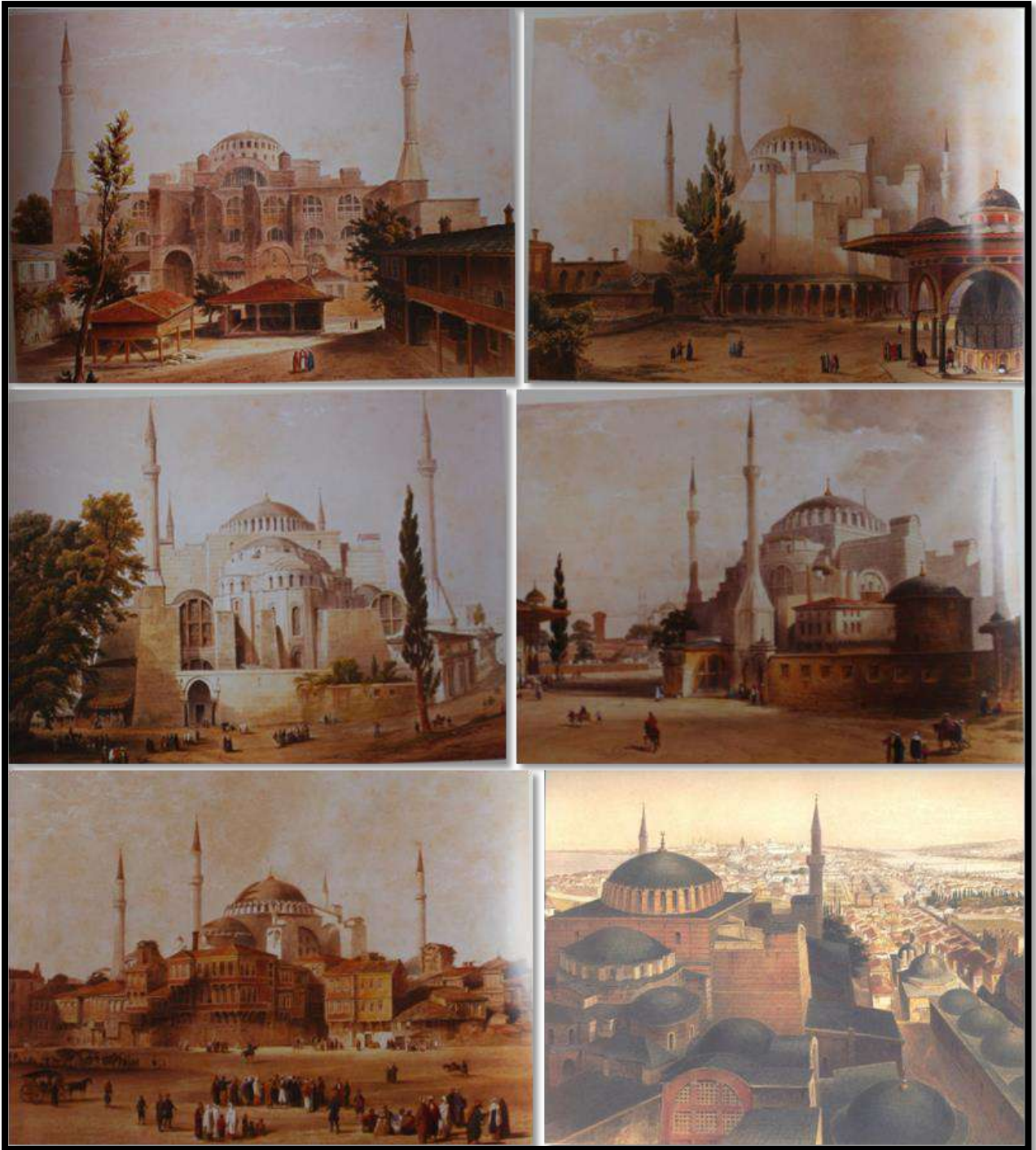
Figure 7: Exterior Gravures of Hagia Sophia, Gaspare Fossati, 1852. 7