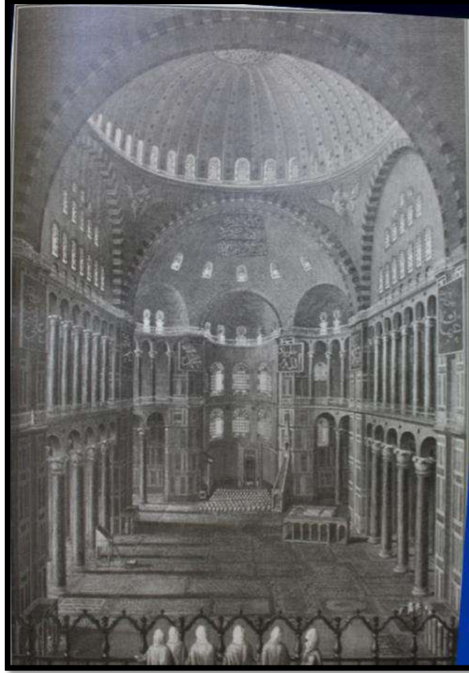
Figure 5: Hagia Sophia, Mouradgea D'ohhson, 1787. 5

Fossatti Brothers restored the Hagia Sophia in 1848. After the restoration in 1852 Gaspare Fossatti prepared a gravure album book of Hagia Sophia named "Aya Sofia Constantinople as Recently Restored by Order Of H.M. The Sultan Abdul Medjid" published in London by contribution of Sultan Abdulmecid (Akgündüz, 2005).