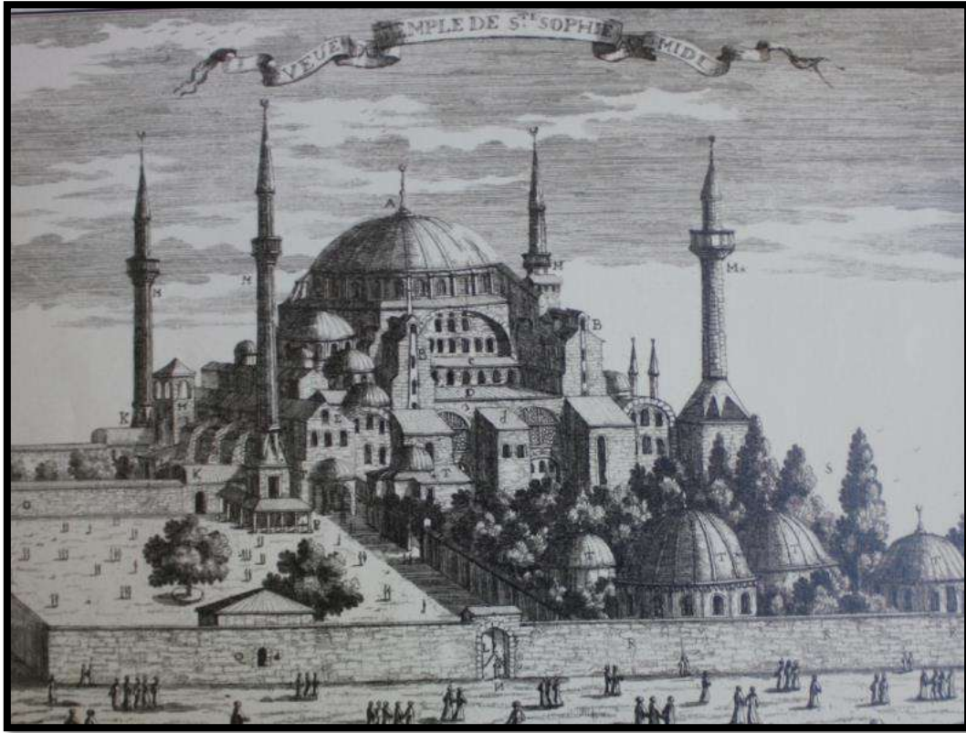
Figure 3: Hagia Sophia, Joseph Grelot, 1680. 3

Guillaume Joseph Grelot is an artist and writer described Istanbul and Hagia Sophia in 17th century. His gravures published in 1680 in his book named “Relation Nouvelle D’un Voyage De Constantinople”. Hagia Sophia was depicted as the great mosque of Istanbul with four minarets of the building (Figure 3). In addition of his exterior gravures belong to Hagia Sophia also he had drawn interior gravures. Yet, he had interpreted the interior design of Hagia Sophia by removing the Islamic icon and writings. He had given point to face of the winged angles on the pendants which faces were closed after the church became a mosque (Figure 4).