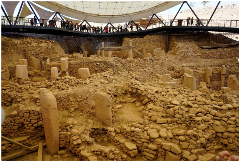
Figure 2. Temples and pillars at Göbeklitepe as a United Nations Educational, Scientific and Cultural Organization (UNESCO) World Heritage Site